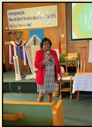
Trinity Church St. Joseph, MO