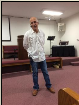
The Bridge Lake Wales, FL

These are a few of our churches across the nation.