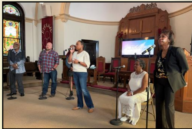
Holsey Chapel St. Joseph, MO