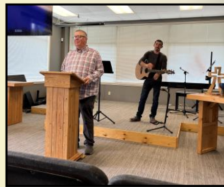
The Firehouse Churches Bremerton/Poulsbo, WA