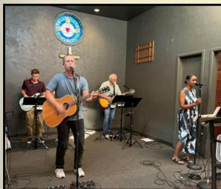
LifePoint Church Oakdale, CA