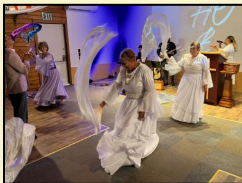
Iglesia Monte de Sinai Waterford, CA