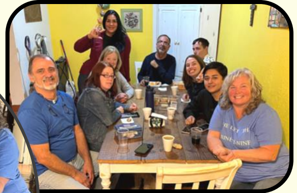
"The Deaf are the unreached people group in every people group." Tim Brown